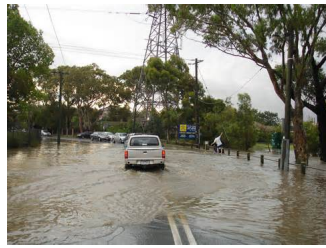
FLOOD Heavy+Rain Floods+Central+Serbia+FLOOD+

For this potentially serious disaster in